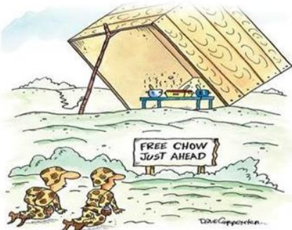
"It looks like a trap to me, sir."