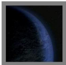
Acamar III (Ugh!)

Seriously, go there only if you're a Klingon who'd enjoy hunting such a fierce predator as the Mooshor. The rest of you would be better off visiting the planet in a holodock while making sure the safety features are securely in place.* ♦