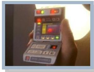
The TR-590 Tricorder X

In addition to the TR-890, a smaller, palm-sized device was in use during this period. Henry Starling found one aboard the Aeon and carried it with him at all times. He used it in an attempt to escape Voyager's transporter when the ship tried to retrieve the Aeon in 1996. (VOY: "Future's End, Part II")* ♦