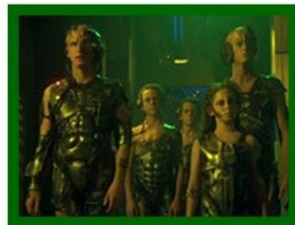
Juvenile Borg drones

The precise origins of the Borg are unclear. As of 1484 they were reported as controlling only a handful of systems in the Delta Quadrant, but by 2373 they had assimilated thousands of worlds. In addition to this stronghold in the Delta Quadrant, the Borg also dispatched vessels throughout the galaxy via transwarp conduits.* ♦