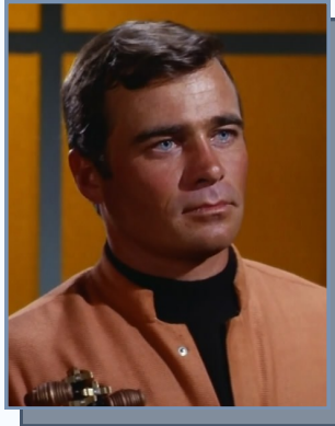
Zefram Cochrane - 2267

Greetings once more ladies, gentlemen and other worldly species of Esprit Starbase. You fine officers of this fine establishment have all heard of the great Zefram Cochrane; human scientist who is best remembered as the great man who invented the warp drive. Officially, he is the first human to have travelled faster-than-light, and it is thanks to this achievement that First Contact was achieved with the Vulcans. And this month, I hope to bring you a bit more information on the great man whom we have all come to know and love.