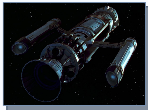
Cochrane's Ship, the Phoenix

"Don't try to be a great man. Just be a man, and let history make it's own judgements." - Zefram Cochrane - 2073