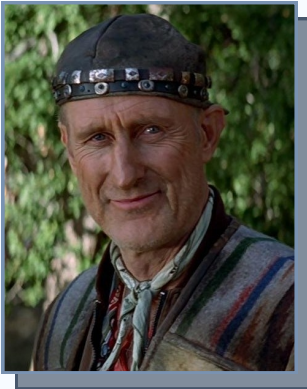
Zefram Cochrane - 2063