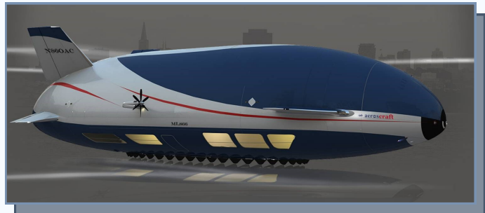
Aeroscraft: the Flying Luxury Hotel of Tomorrow

Destined to be used by the US military, the 230-foot-long Aeroscraft ML866 will be able to carry up to 66 tons of cargo and fly at 220 kilometres per hour. Bigger models have been devised. From the look of it, I wouldn't be surprised to see Aeroscrafts sold to passenger airlines in a near future.