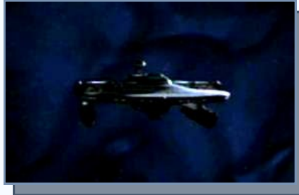
USS Bozeman NCC-1941

As it is known, the USS Bozeman was lost to the Federation for about 90 some years in a temporal anomaly. Oh dear, that's a long time when compared to the human lifespan. Luckily, the Enterprise D crew with its