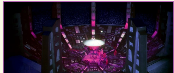
At the heart of V'Ger: Voyager VI

Farewell, V'Ger, and good luck! Your journey is really just beginning, it will be a few billion years before you reach another star system. One word of advice, though: during your long lonely trip please try to avoid any thoughts about returning to your home planet the way your cousin did in the movie. That might not be a good idea. ♦