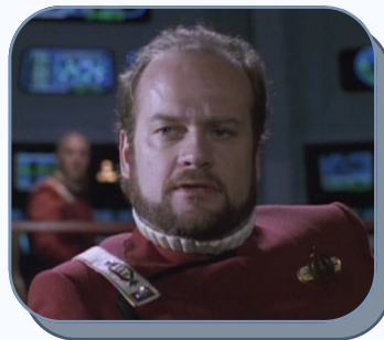
Grammer as Capt. Batesman

Yet that is not what I am here to teach you, that was only the back story. At the end of the "Cause and Effect" episode, the captain appears on the bridge of the Enterprise's view screen. Now it's not the captain as a character that's important, it's the person behind the mask that is. Here's the "did you