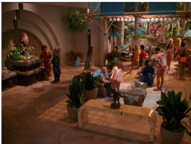
Risa Tourist Resort

So, thanks must be given to Colonel Y'Wanna for forcing me to take a vacation. If she hadn't done so, I wouldn't have had one of the most relaxing, and funnest weeks ever. I would definitely recommend it to anyone looking for a holiday, and I will most definitely be returning there next year. ♦